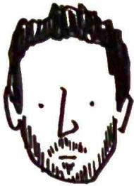
RAMI, AS A CONSTRUCT OF LINES & SHAPES.